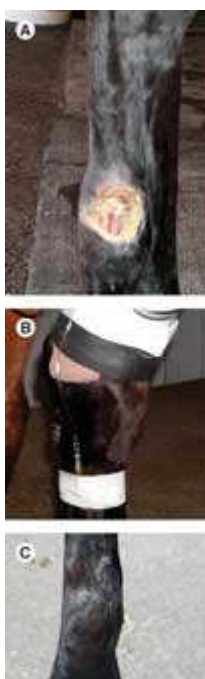
Figure 1. (A) Lacerated tendon sheath presented 2.5 mo after initial injury. (B) Intravenous RLP performed in the medial plantar vein of horse in A. (C) Lacerated tendon sheath 6 mo after surgery and treatment with IV RLP. - To view this image in full size go to the IVIS website at www.ivis.org . -